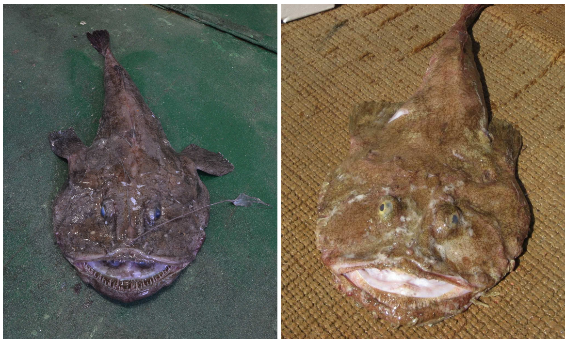
Fig. 2.1.2. Monkfish, Lophius piscatorius (left) and blackbellied anglerfish, Lophius budegassa (right).

results obtained showed an overfishing condition. At present, no stock assessments are available for L. piscatorius in the Mediterranean; evaluations on the exploitation status of this species have been performed in Atlantic, Faroe Islands (Ofstad et al., 2013), showing that the species is suffering the excessive fishing pressure. Nowadays, no specific management measures for the two Lophius species are applied in Mediterranean. No minimum landing size has been established for the two species in accordance with EU Reg. No. 1967/2006.