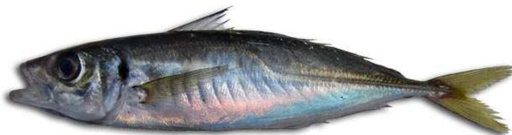
Fig. 2.2.2. Mediterranean horse mackerel, Trachurus mediterraneus

species with maximum longevity of 10-12 years reported in the past (Stoyanov et al., 1963), but nowadays the age of most of the individuals in the Black Sea population does not exceed 6 years. The horse mackerel matures at the age of 1-2 years in spring-summer (May-August), when the main feeding and growth season also takes place. It spawns in the upper layers, mainly in the open part of the sea as well as near the coast (Stoyanov et al. 1963; STEFC 2017b).