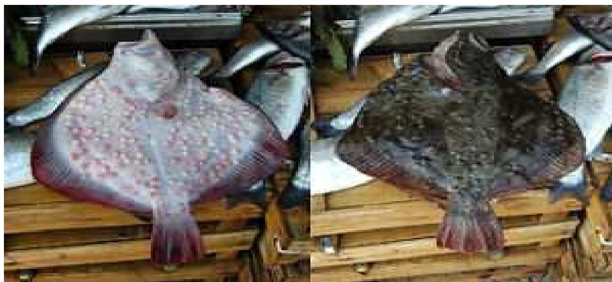
Fig. 2.2.1. Turbot, Psetta maxima , (Photo by Valodia Maximov)

Turbot, Psetta maxima , (Fig. 2.2.1) is a large, broad-bodied left-eyed demersal flatfish that belongs to the family Scophthalmidae. Its geographical range extends from Icelandic seas to the Mediterranean, including the Sea of Marmara, and the Black Sea (Blanquer et al. , 1992). The turbot is one of the most important commercial fish species in the Black Sea, where it is heavily fished using otter trawls, gillnets, beach seines, and trammel nets (Aydin and Sahin, 2011).