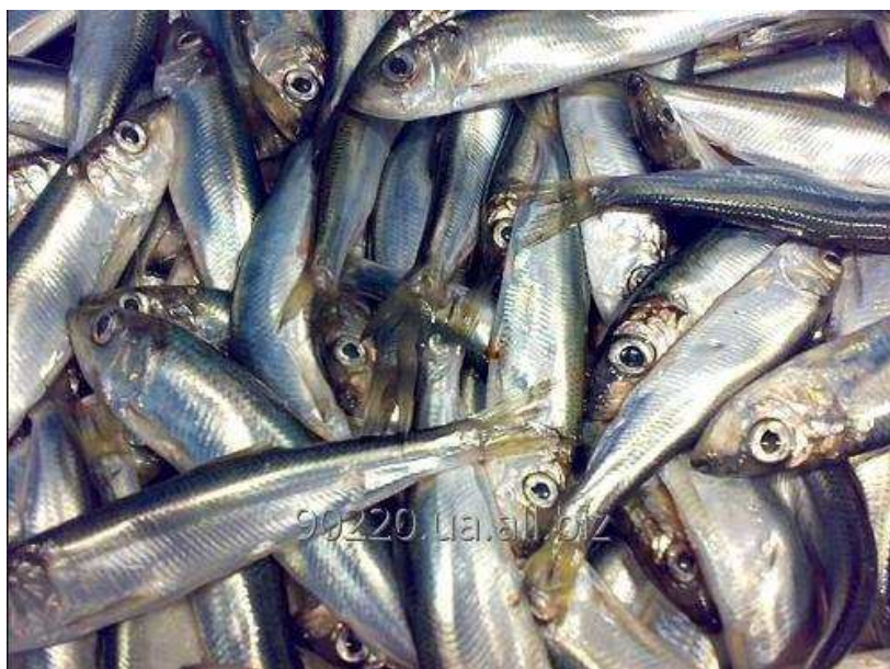
Fig. 2.2.3. Sprat, Sprattus sprattus

well as for the marine predators (including other commercial fish such as whiting and turbot) and the ecosystem as a whole (Daskalov et al 2008, Shlyakhov and Daskalov 2008). Together with the anchovy, sprat is one of the most abundant, planktivorous, pelagic species. The level of its stocks depends on the conditions of the environment mainly and on the fishing effort. The changes in the environment due to anthropogenic influence affect the dry land as well as the world ocean. The level of the sea pollution and its “self-purifying” ability are completely different. There is a clear indication of changes in the nature equilibrium in the corresponding ecological niches. The greatest impact in the world ocean is played by commercial fisheries, which directly devastate a significant part of the given species populations. As a result of this, some of the species stocks are declined or depleted.